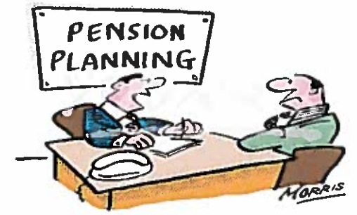
"It's Monday today and you retire on Friday. Don't you think you've left it a bit late?"

Effective January 1,2022 the MPP is changing and pensionable service earned after this date will fall under new rules. All your pensionable time prior will be calculated in the same manner. This is to improve equity among all members - and almost all of our members will receive a higher pension amount upon retirement. For more detailed information please go to https://mpp.pensionsbc.ca/